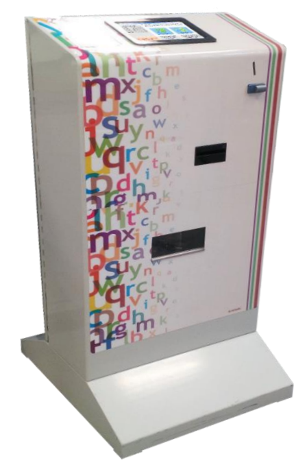
CD6/CD7 Pedestal version

These dispensers enable paper or plastic cards to be dispensed against coins and/or banknotes.